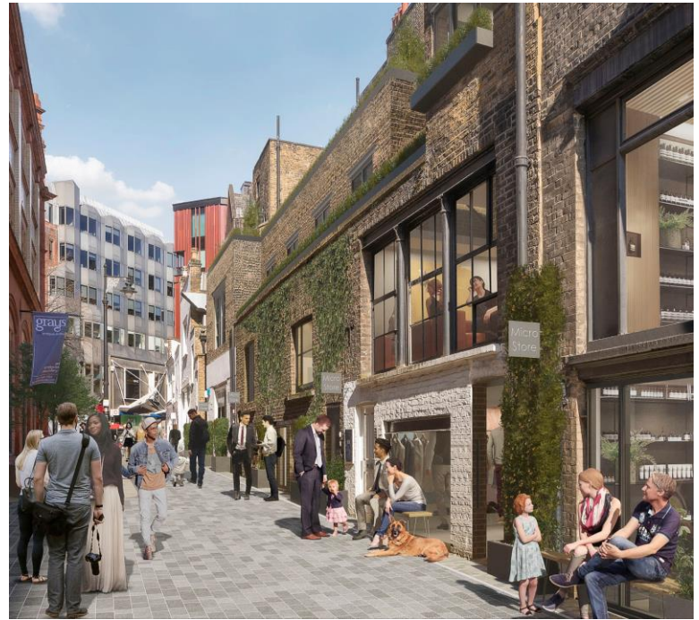
Left: Extent of South Molton Street Project. Right: Indicative CGI's of the South Molton Lane