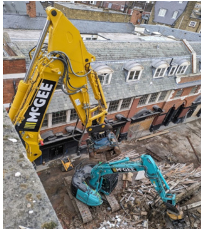
The long arm excavator carrying out demolition work.

We will make every effort to minimise noise, vibration, and dust during the construction works. To achieve this, we have set up NVD monitoring equipment at sensitive receptor locations around the site. The monitoring will ensure that the work complies with the agreed NVD levels outlined in the Westminster Council Code of Construction Practice 2022 and statutory guidelines.