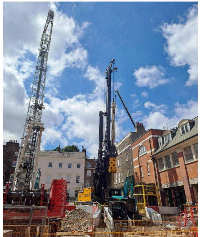
Our Piling Rig and Crawler Crane on site.