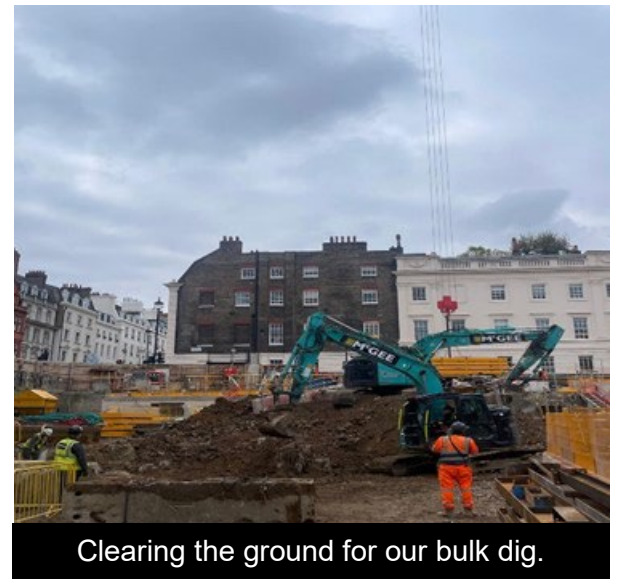
Clearing the ground for our bulk dig.