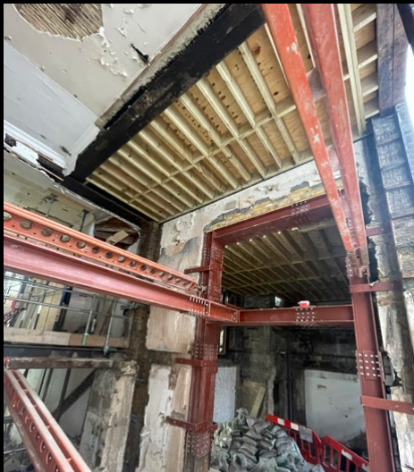
New steel picture frame has been installed in the party wall between 17 and 18 SMS