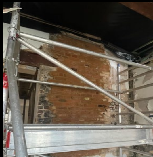
Heritage brickwork repair in 16 SMS

Anthemion Restoration are our specialists in heritage brickwork repair they have started some careful brickwork repairs in 15 and 16 SMS. Anthemion will also be carrying out some samples of brickwork repair and cleaning to the external façades of 15 to 17 SMS during November.