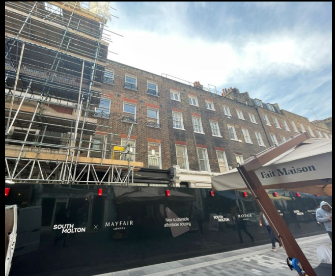
Scaffold erection continues behind the hoarding at SMS

Further Scaffolding will be installed between 19 to 23 South Molton Street, with erection due to start in early November.