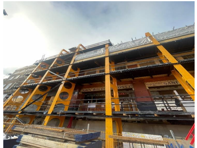
Our new façade retention structure.