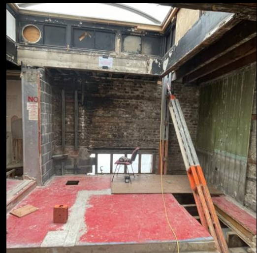
Internal and external temporary works installed at 17 SMS