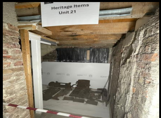
Safe storage of heritage items discovered on site

We have made a special home for the safekeeping of heritage items discovered on site. These will be kept and protected until they can be reinstated once works have been completed.