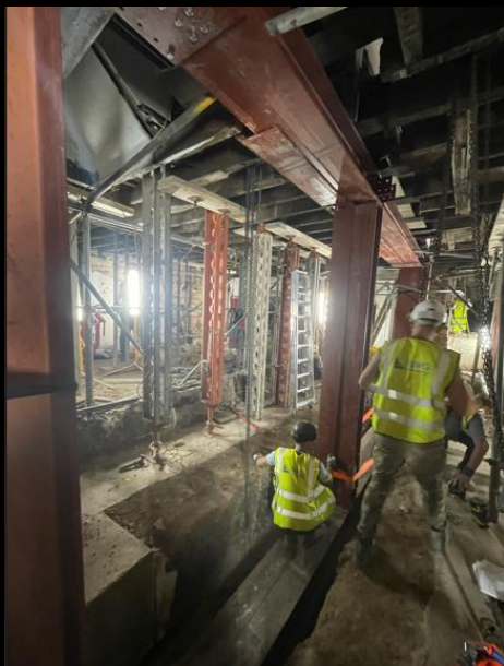
Installation of steel frame to 15/16 SMS basement