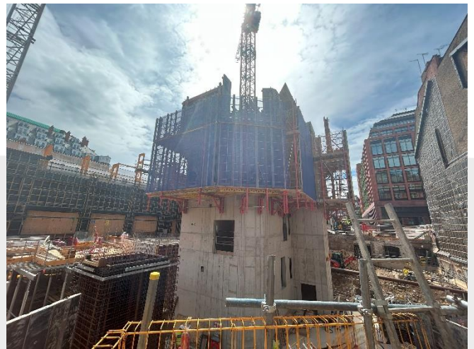
North Block Core progress

1,044 tonnes of soil were sent for re-use, supporting a circular economy.