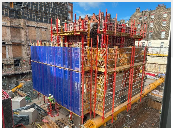
South Block Core progress