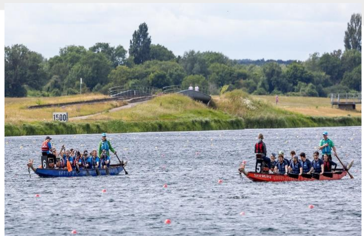
Grosvenor's Annual Dragon Boat Regatta