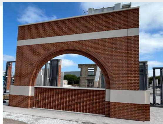
Brickwork precast panel Mock Up