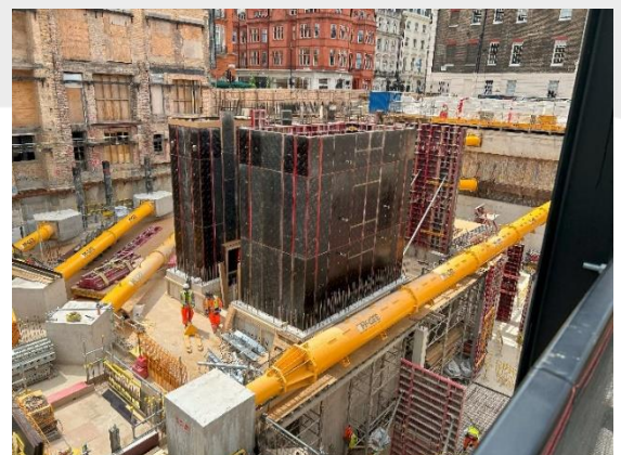
South Block – Shuttering of the concrete core